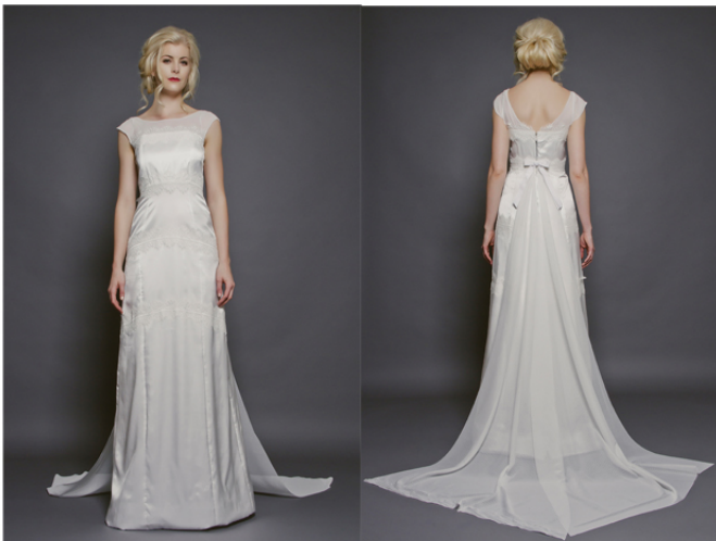
11019 - ORCHID

CHARMEUSE SHEATH WITH CRINKLED CHIFFON YOKE AND CAP SLEEVE; LACE DETAIL THROUGHOUT; TAFFETA BOW AT BACK WITH DETACHABLE POINT D'ESPRIT TRAIN. 100% SILK SHELL AND LINING; NYLON LACE AND TRAIN. AVAILABLE IN WHITE OR IVORY. SIZES 2-14.