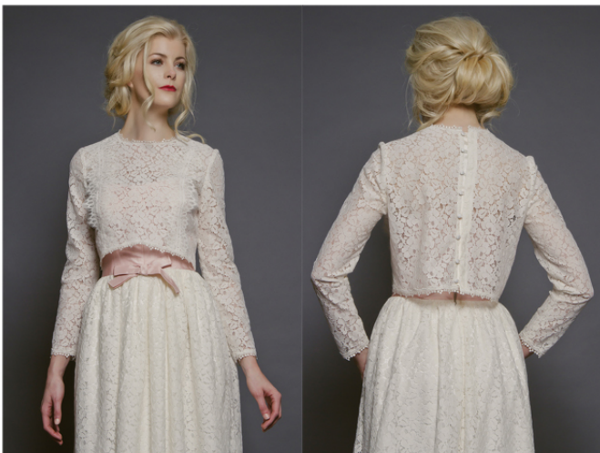
41001 - DAISY

CRINKLED CHIFFON BLOUSE WITH CAP SLEEVE. 100% SILK WITH NYLON LACE TRIM. AVAILABLE IN OFF-WHITE. SIZES S, M, L.