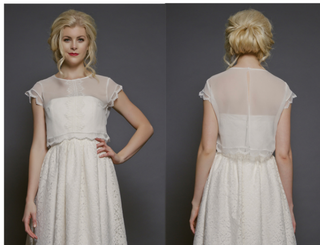
41002 - DAFFODIL

SLEEVELESS, LACE, KNEE-LENGTH DRESS. 100% NYLON SHELL WITH 100% SILK LINING. AVAILABLE IN IVORY. SIZES 2-14.