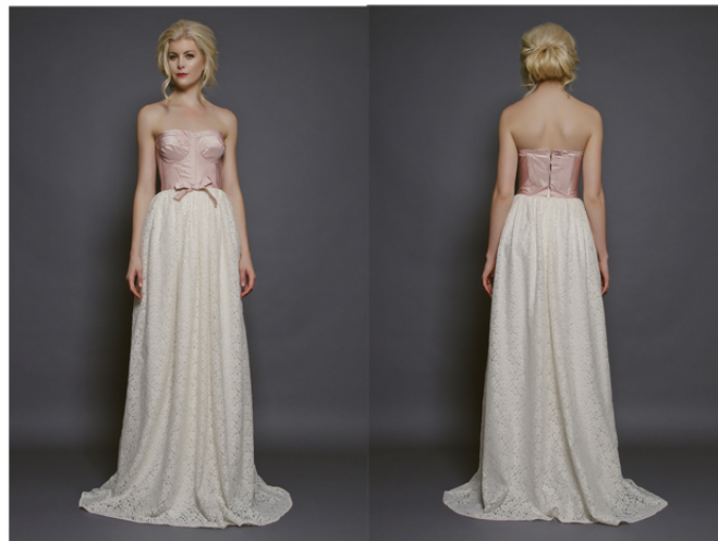
11022 - PEONY

GOLD STRIPED CHIFFON GOWN WITH TAFFETA BOW AT CENTER WAIST. 100% SILK. SIZES 2-14.