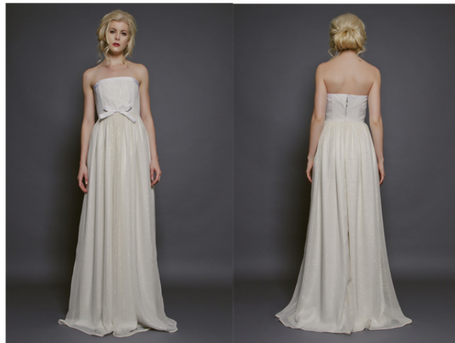
11021 - DEANSIE

BONED SILK TAFFETA BODICE WITH STRAPS; LACE BORDERS AT WAIST. POINT D'ESPRIT SKIRT. 100% SILK BODICE AND LINING; NYLON LACE AND SKIRT. AVAILABLE IN WHITE OR IVORY. SIZES 2-14.