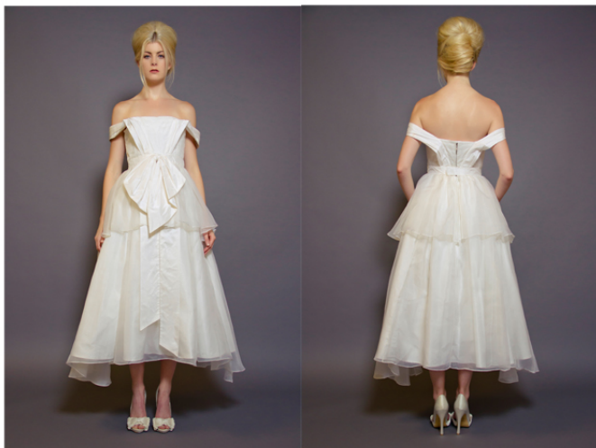
11008 - IRIS

STRAPLESS ORGANZA WITH LILY OF THE VALLEY AT WAIST; TAFFETA CORSET. 100% SILK. AVAILABLE IN WHITE OR IVORY (WHITE FLOWERS ONLY). SIZES 2-14. ALSO AVAILABLE FLOOR LENGTH.