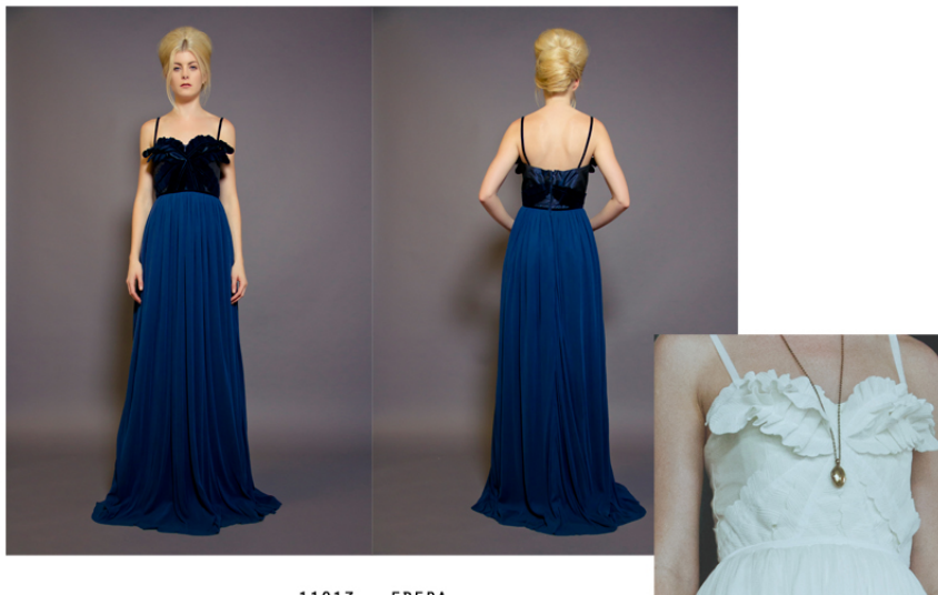
11013 - EDERA

ENGLISH NET BODICE WITH PIN TUCK SKIRT. FLOWERED BODICE WITH SWAROVSKI CRYSTALS. KEYHOLE BACK. BUTTONS ALONG ZIPPER. TAFFETA CORSET. 100% COTTON SHELL/100% SILK LINING. AVAILABLE IN WHITE OR IVORY. SIZES 2-14.