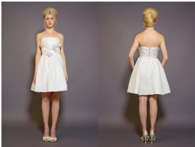
11005 - JUNIPER

STRAPLESS ORGANZA WITH LILY OF THE VALLEY AT WAIST; TAFFETA CORSET. 100% SILK. AVAILABLE IN WHITE OR IVORY (WHITE FLOWERS ONLY). SIZES 2-14. ALSO AVAILABLE FLOOR LENGTH.