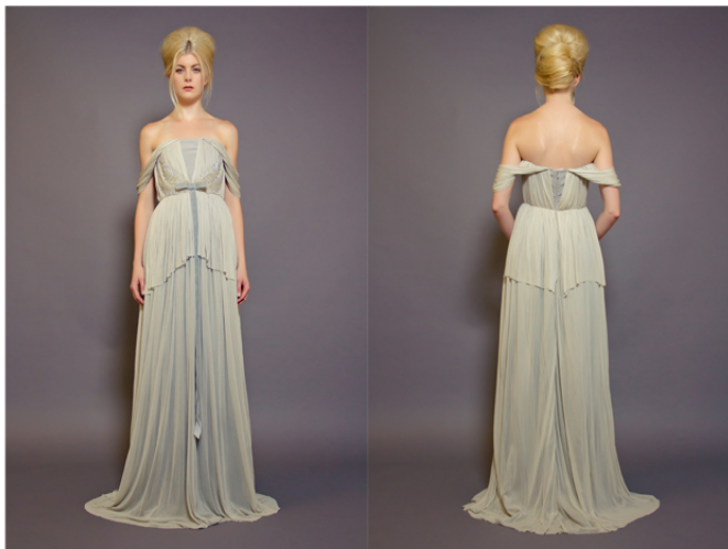
11012 - LOTUS

SILK TULLE WITH BEADED FEATHER DETAIL AND VELVET BOW AT WAIST; TAFFETA CORSET. 100% SILK. AVAILABLE IN WHITE, IVORY, BLUSH, GREY OR NAVY. SIZES 2-14.