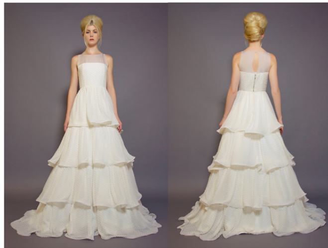
11003 - GARDENIA

SWISS DOT WITH CHIFFON YOKE; KEYHOLE BACK; TAFFETA CORSET; CRINOLINE. 100% SILK. AVAILABLE IN WHITE OR IVORY. SIZES 2-14.