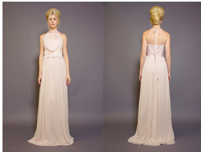
11010 - ARCIERE

ORGANZA WITH TAFFETA STRAPS AND BOW; TAFFETA CORSET; CRINOLINE. 100% SILK. AVAILABLE IN WHITE OR IVORY. SIZES 2-14.