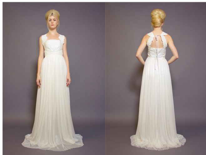
11011 - VALORE

SILK TULLE WITH VELVET FEATHER DETAIL AT WAIST; VELVET TIES; TAFFETA CORSET. 100% SILK. AVAILABLE IN WHITE, IVORY, BLUSH, GREY OR NAVY. SIZES 2-14. ALSO AVAILABLE KNEE LENGTH.