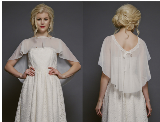
41003 - BUTTERCUP

LACE BLOUSE WITH LACE BORDER TRIM. COVERED BUTTONS AT BACK. 100% NYLON. AVAILABLE IN IVORY. SIZES S, M, L.