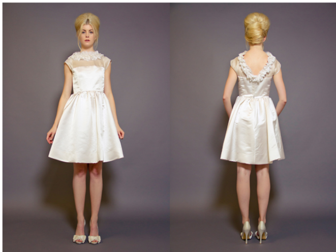
11002 - TULIPE

SWISS DOT WITH CHIFFON YOKE; KEYHOLE BACK; TAFFETA CORSET; CRINOLINE. 100% SILK. AVAILABLE IN WHITE OR IVORY. SIZES 2-14.