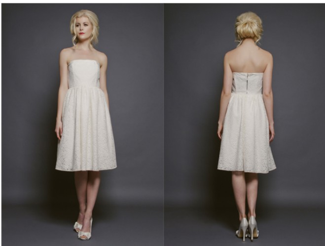
11023 - CHAMOMILE

SLEEVELESS, LACE, KNEE-LENGTH DRESS. 100% NYLON SHELL WITH 100% SILK LINING. AVAILABLE IN IVORY. SIZES 2-14.