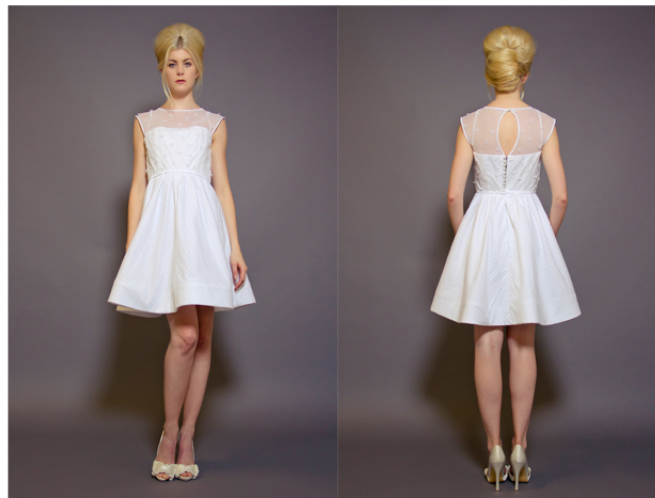
11015 - POPPY

SILK TULLE WITH BEADED FEATHER DETAIL AND VELVET BOW AT WAIST; TAFFETA CORSET. 100% SILK. AVAILABLE IN WHITE, IVORY, BLUSH, GREY OR NAVY. SIZES 2-14.