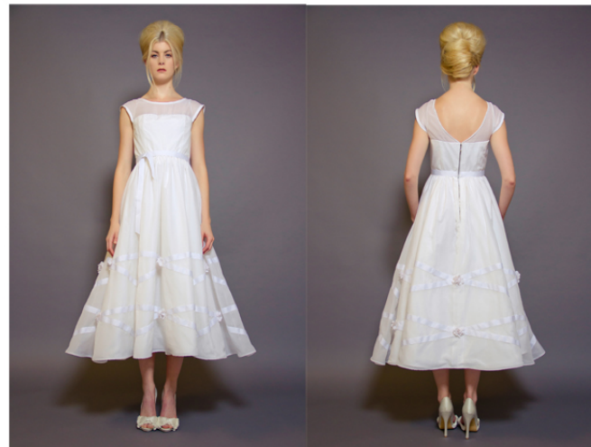
11016 - LAUREL

SILK TULLE WITH VELVET FEATHER DETAIL THROUGHOUT BODICE; TAFFETA CORSET. 100% SILK. AVAILABLE IN WHITE, IVORY, BLUSH, GREY OR NAVY. SIZES 2-14. ALSO AVAILABLE KNEE LENGTH.