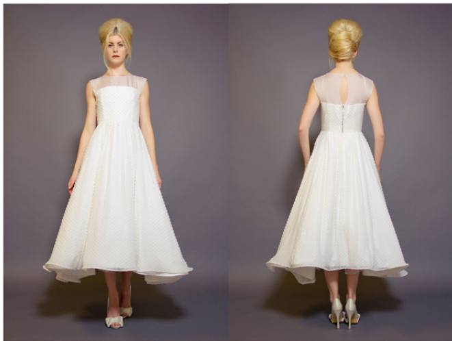
11001 - CAMELLIA

SWISS DOT WITH CHIFFON YOKE; KEYHOLE BACK; TAFFETA CORSET; CRINOLINE. 100% SILK. AVAILABLE IN WHITE OR IVORY. SIZES 2-14.