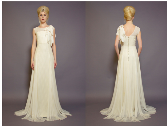
11004 - LIERRE

SWISS DOT; SILK TULLE SCARVES AT SHOULDER AND SKIRT; TAFFETA CORSET. 100% SILK. AVAILABLE IN WHITE OR IVORY. SIZES 2-14.