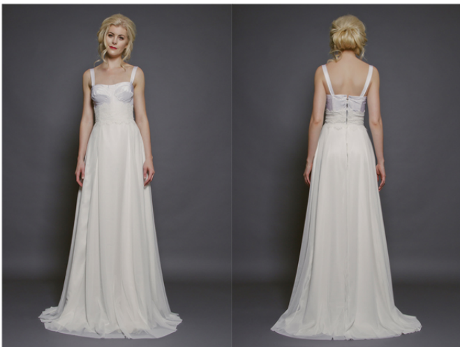
11020 - WISTERIA

CHARMEUSE SHEATH WITH CRINKLED CHIFFON YOKE AND CAP SLEEVE; LACE DETAIL THROUGHOUT; TAFFETA BOW AT BACK WITH DETACHABLE POINT D'ESPRIT TRAIN. 100% SILK SHELL AND LINING; NYLON LACE AND TRAIN. AVAILABLE IN WHITE OR IVORY. SIZES 2-14.